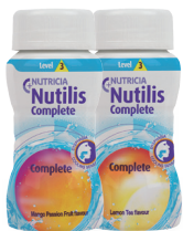
Nutilis Complete Drink Level 3