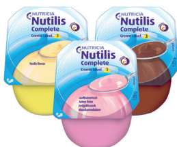
Nutilis Complete Crème Level 3