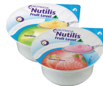
Nutilis Fruit Level 4