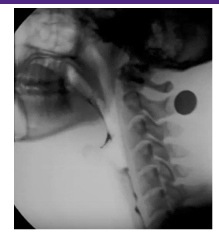
Non-disordered swallow with residue from 100% weight/volume barium

http://steeleswallowinglab.ca/srrl/bestpractice/barium-recipes/iddsi-bariumcalculator/