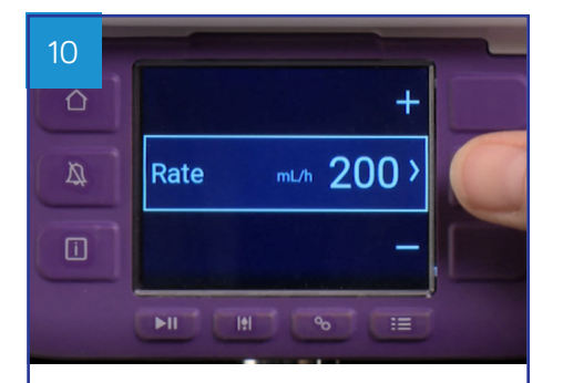
Set rate by pressing the +/- buttons. Press the middle button to confirm