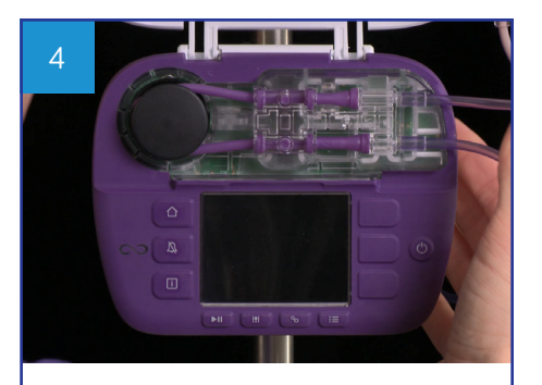
Open pump door and insert giving set

Screw on tightly; hang the bottle or container on the back of the stand using the z-hook or place in go-frame