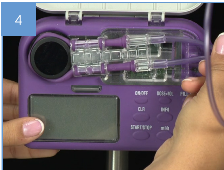
4 Open door and insert giving set