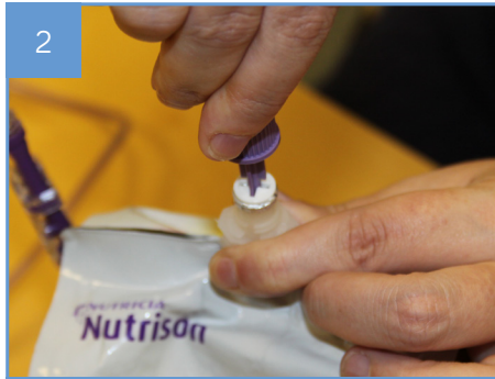
2 Attach Flocare Infinity Pack giving set to prescribed product