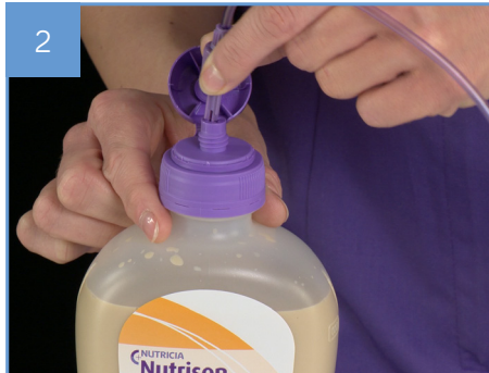
2 Attach Flocare Infinity Pack giving set to prescribed product