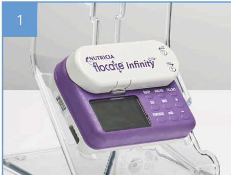
1 Attach Flocare Infinity pump to Z-Stand