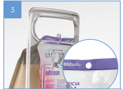
3 Using the hole at the top of the Pack hang from rear of Z-Stand