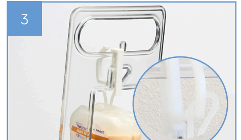
3 Using hanging eye on OpTri bottle (or Z-Hook if available), hang OpTri bottle from rear of Z-Stand. For 1 litre OpTri bottle, hang from the TOP and rear of Z-Stand using a Z-Hook