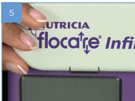
5 Close door (click)