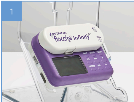
1 Attach Flocare Infinity pump to Z-Stand