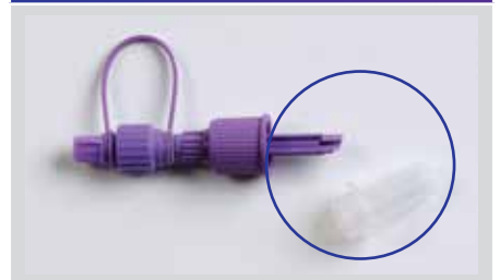
Remove the dust cap from the bolus adaptor.