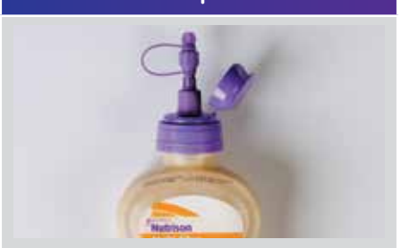
Insert bolus adaptor into bottle and screw firmly to ensure there is a tight seal.