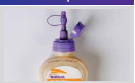
Reseal tube feed bottle by closing the bolus adaptor & store as directed.