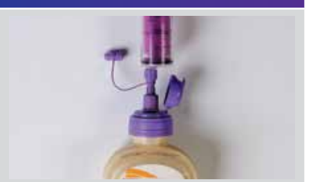
Attach the 60ml syringe to the bolus adaptor.