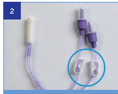
Close both the clamps on the Flocare 2-Pack connector

Open the packaging and lay contents on a clean dry surface