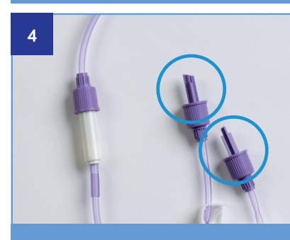
Remove the dust caps from both ends of the 2-Pack connector