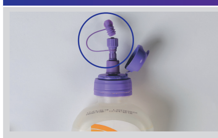
Remove cap from the bolus adaptor. Flush the feeding tube with prescribed amount of water.