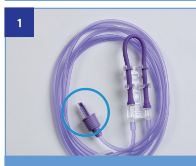
Remove the dust cap from the Flocare giving set and discard