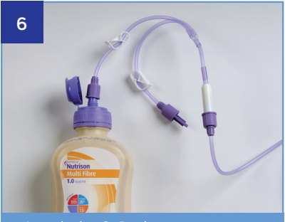
Attach the 2-Pack connector port to each of the bottles of prescribed tube feed (or water)

Programme the pump as advised by your healthcare professional. *Please note, you will need to use the 'fill set' facility to prime your feed to the end of the giving set before you attach to your feeding tube.