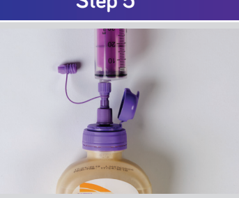
Attach the 60ml syringe to the bolus adaptor.

Attach the filled syringe onto the end of the feeding tube or extension set. Push the plunger gently to administer feed and repeat until prescribed amount has been administered.