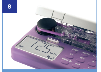
Insert the giving set into the pump and open the clamps on the 2-Pack connector