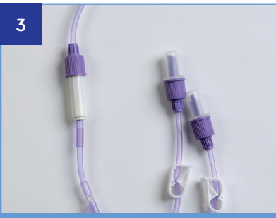
Attach the white port of the Flocare 2-Pack connector to the end of the giving set and screw together tightly